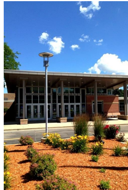
Brookfield Central High School