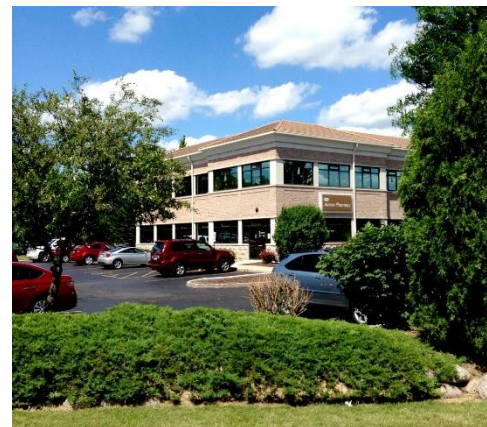
NorCal Professional Building