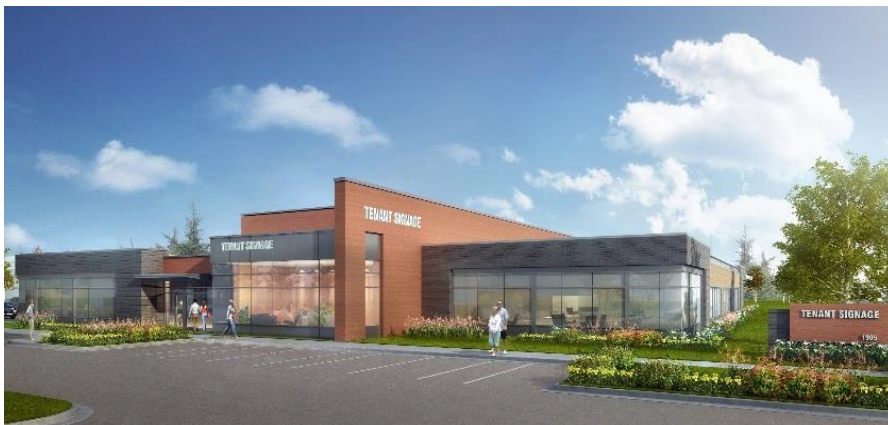
Calhoun Health Center